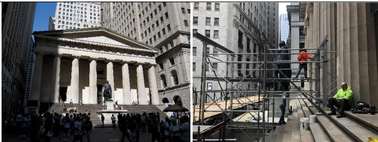
Left: Exterior of Federal Hall

Location: Federal Hall National Memorial, New York