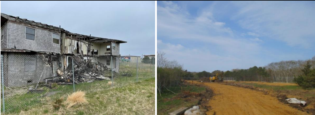
Left: Dilapidated Highlands Center building