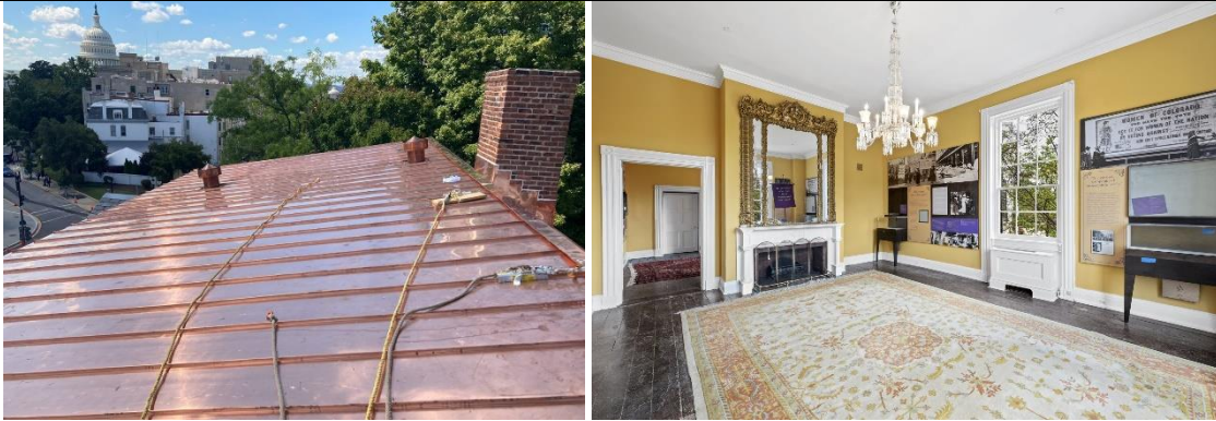
Left: Installation of replacement copper roofing