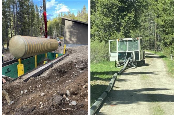
Left: Replacement surge tank adjacent to lift station

Location: Grand Teton National Park, Wyoming