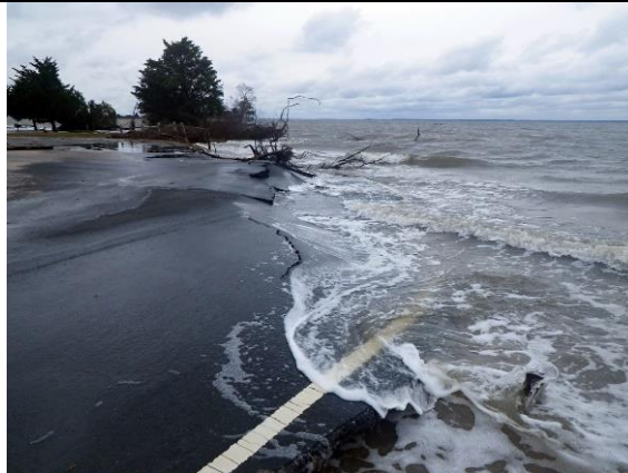
Visitor access road at Assateague Island National Seashore destroyed by flooding.

The National Park Service partnered with Western Carolina University to create a Coastal Hazards and Sea-Level Rise Asset Vulnerability Assessment Protocol to standardize methodology and best practices for assessing risks to coastal facilities. To date, vulnerability assessments have been completed for more than 40 coastal parks, providing information to inform and prioritize management investments. The development of additional vulnerability assessments to include facilities, natural and cultural resources across the NPS is a continuing priority in FY 2025.