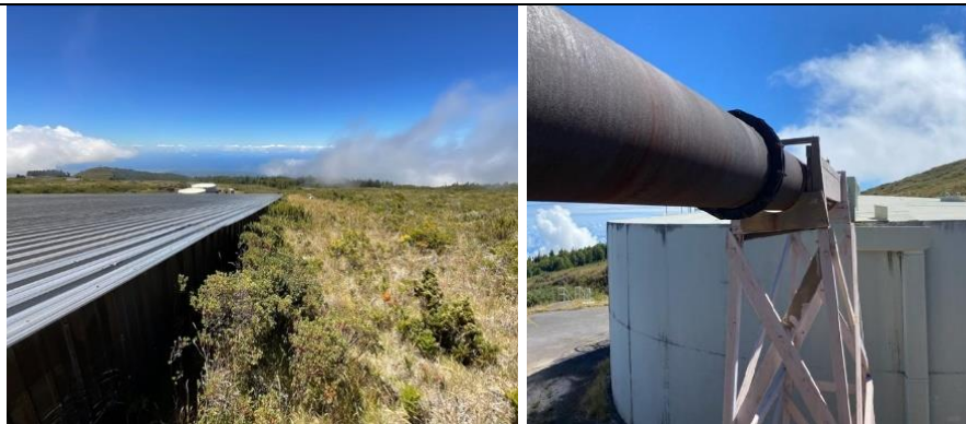
Left: Rain Catchment Structure

Location: Haleakalā National Park, Hawai'i