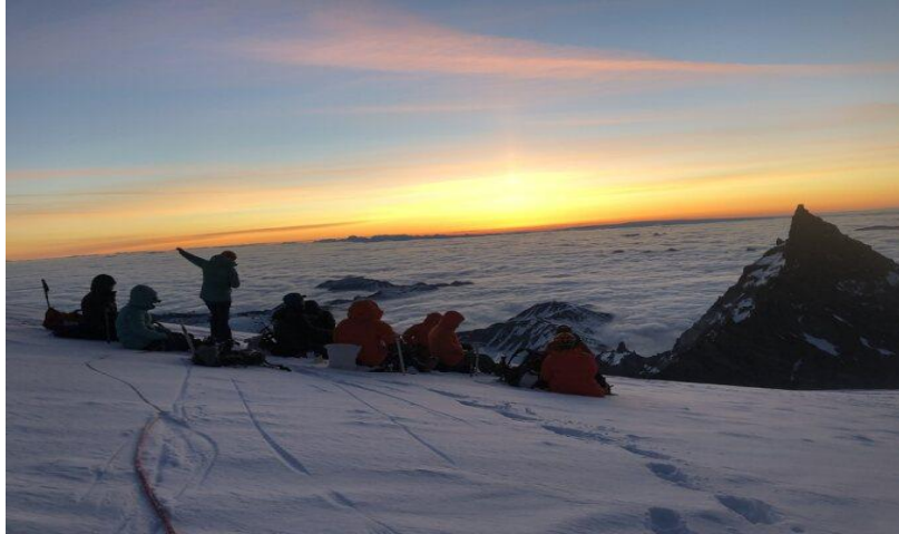
Glaciated peaks in Mount Rainier National are popular visitor destinations.

Ascending to 14,410 feet above sea level, Mount Rainier stands as an icon in the Washington landscape. An active volcano, Mount Rainier is the most glaciated peak in the contiguous U.S.A., spawning five major rivers. Subalpine wildflower meadows ring the icy volcano while ancient forest cloaks Mount Rainier's lower slopes. Wildlife, from black bears and mountain goats to marmots and pikas, abounds in the park's ecosystems. The park, established in 1899 as the fourth national park, is more than 230,000 acres in size and hosted 1,622,395 visitors in 2022.