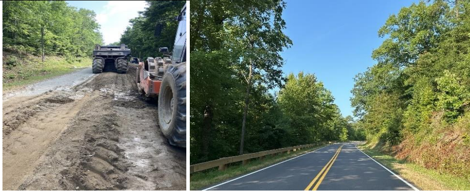
Left: Parkway rehabilitation in-progress

Location: Great Smoky Mountains National Park, Tennessee