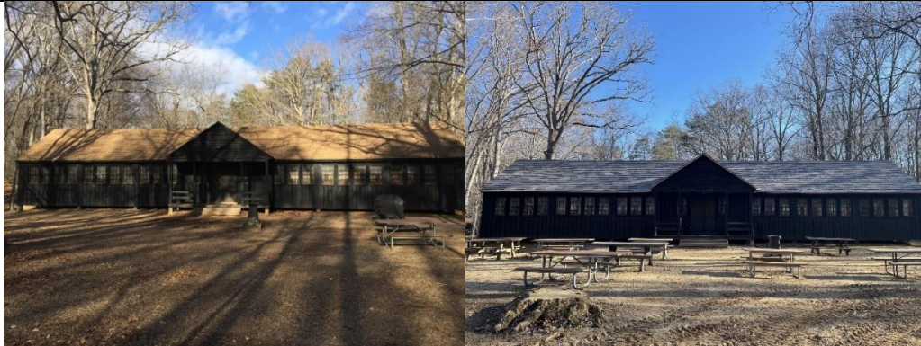
Left: The deteriorated asphalt shingle roof, contrasting with the building's décor. Right: The replaced roof, with added weather shielding and more appropriate aesthetics.

Projects like this one at Prince William Forest Park, to perform cyclic roofing with sustainable materials are funded through the Cyclic Maintenance Program. This operation involved removing 80 squares of asphalt shingles and replacing with composite enviroshake shakes; overlay of plywood sheathing; added ice and water shield; new copper flashing; and replacement of all vent boots. The roof was returned to new condition.