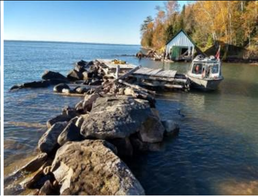
Left: Wave action at Little Sand Bay Marina Right: Storm damage at Devils Island Marina

This $17.2 million project will rehabilitate and stabilize the marina waterfront systems at Little Sand Bay and Devils Island. It will reinforce the seawall and wooden cribbing to reduce exterior wave overtopping and interior wave height. Work at Devils Island will also include reconstruction of the boat house using salvaged materials.