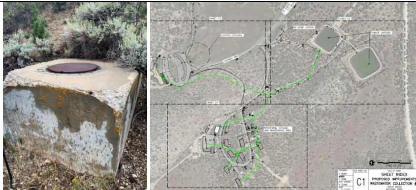
Left: Existing manhole

Location: Great Basin National Park, Nevada