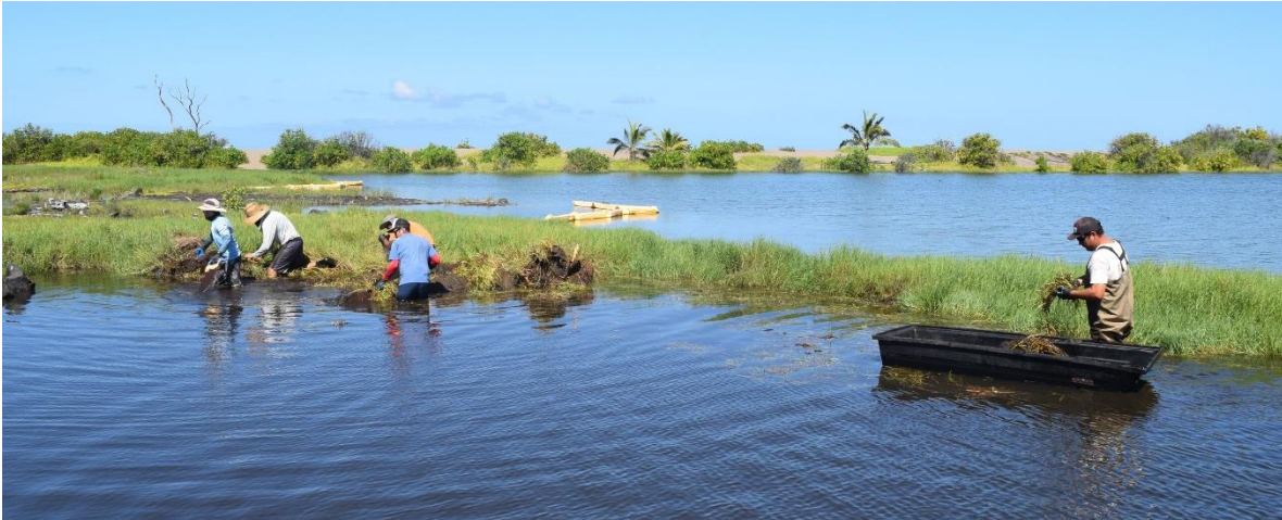
The Dryland Hui group aid in vegetation removal at “Aimakapa” as part of an aquatic restoration effort in Kaloko-Honokohau.

The NPS manages more than 20 million acres of wetlands, including salt and freshwater marshes, swamps, peatlands, mudflats, and intertidal zones. These highly productive and biologically diverse systems enhance water quality, control erosion, maintain stream flows, sequester carbon, and harbor at least 35 percent of threatened and endangered species. Approximately 2.2 million acres of NPS aquatic resources require restoration. The NPS has established wetland protection policies and procedures, is acquiring baseline wetland inventory data, and is actively restoring degraded and lost wetlands. Since 2000, program staff have provided restoration assistance to more than 90 NPS units. Restoring physical and biological integrity of degraded aquatic ecosystems enhances visitor experiences and bolsters aquatic resource resilience to the adverse impacts of climate change.