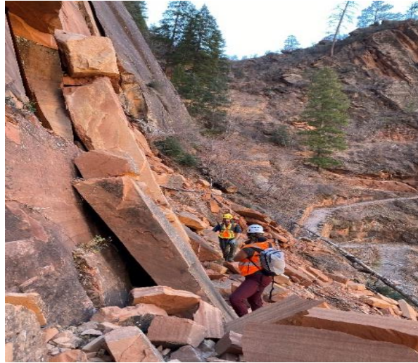
NPS Geologists evaluating a rockfall on a heavily used visitor trail in Zion National Park.

Rockfalls, landslides and fast-moving debris flows can be dramatic, hazardous, and headline-grabbing when they affect people or park infrastructure. In 2022, four park visitors lost their lives due to rockfalls in national park units. Roads, trails, and facilities at many parks have recently sustained major damage from such geological hazards, including Zion, Denali, Hawaii Volcanoes, and Yellowstone National Parks, and Chaco Culture National Historical Park. To better understand and manage the risks of these hazards to visitors and park infrastructure, the NPS led the development of an Unstable Slopes Management Program (USMP), an analytical field tool to help park and other public land managers proactively identify, quantify, prioritize, and mitigate the risks of these kinds of potential geologic hazards to make the best use of their financial resources.