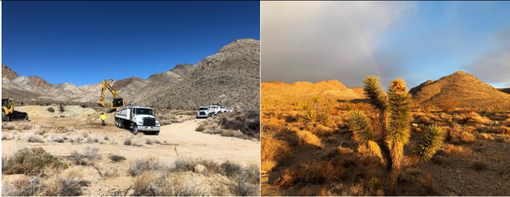
Left: The Valgold Ore Processing area, showing scars from mining activities, as the remediation and restoration work begins. Right: The area at sunset after cleanup.

The Valgold Ore Processing Area is the largest abandoned mine land (AML) site to be remediated on NPS land in the Mojave Desert. Legacy pollution resulting from historic and more recent mining and milling operations within this two-acre site impaired natural resources, limited recreational opportunities, and threatened human health and the environment for decades. The remediation and restoration of the Site in Mojave National Preserve ensures the preservation of natural and cultural resources, including the threatened desert tortoise, iconic Joshua tree, and more.