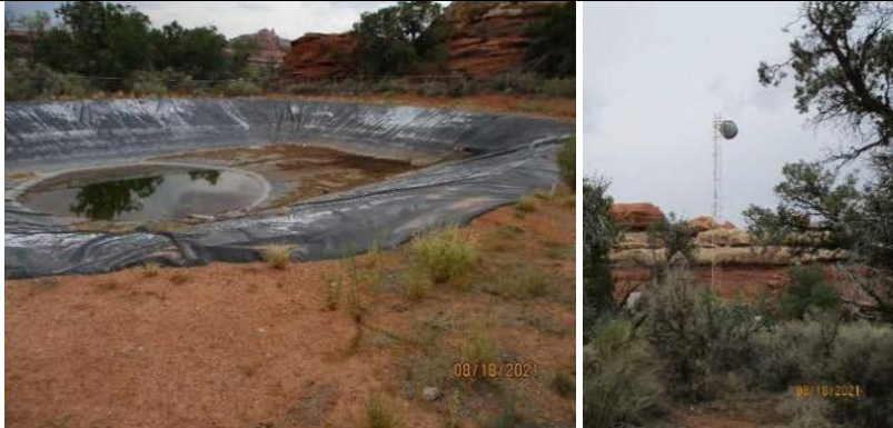
Left: Evaporation pond at Needles water treatment plant.

Location: Canyonlands National Park, Utah