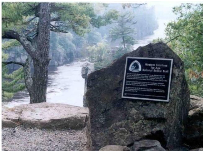
Scenic view of glacial features at the western terminus of Ice Age NST in Wisconsin.

The National Trails System (NTS) is a nationwide network of national scenic trails (NSTs), national historic trails (NHTs), and national recreation trails (NRTs). Of the 32 Congressionally designated national scenic and historic trails, the NPS administers or co-administers 25 trails. In 2023, the existing Ice Age, New England, and North Country national scenic trails were administratively designated as units of the National Park System, joining three other national scenic trails.