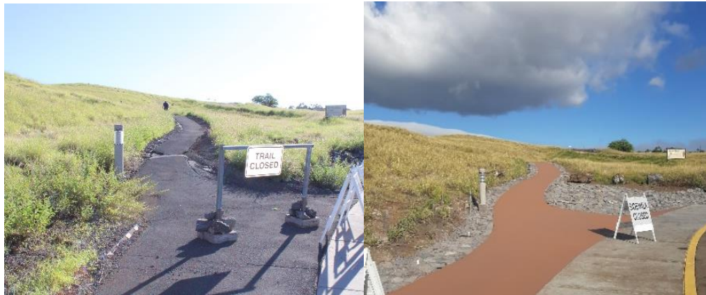
Left: The deteriorated, narrow, and uneven trail surface. Right: The rehabilitated trail, with smooth, even, and renewed surface.

Projects like this one at Puukohola Heiau National Historical Park, to re-design and repair a pedestrian trail from the Visitor Center to the Headquarters facility are funded through the Repair and Rehabilitation program. The project repaired and restored a vital visitor use connection at the visitor center where public restrooms and interpretive programs are provided. The trail is now erosion resistant and protects existing sewer and fiber optic utilities running beneath the trail.