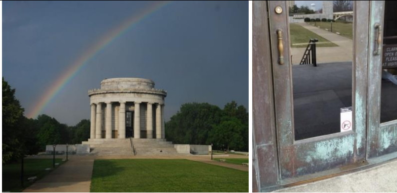
Left: Memorial Building

Location: George Rogers Clark National Historical Park, Indiana