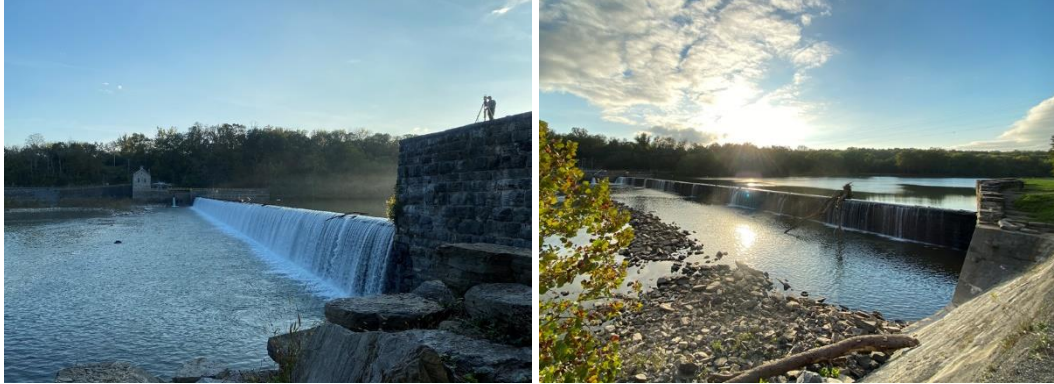
Left: Dam No. 4 Right: Dam No. 5

Location: Chesapeake & Ohio Canal National Historical Park, Maryland