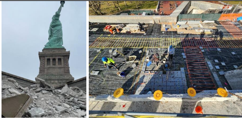
Left: Terreplein pavers being removed