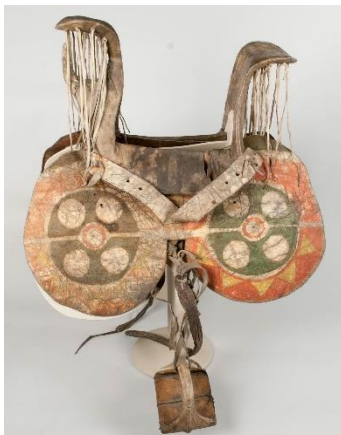
Buffalo Country Saddle from the Wetxuuwi'itin Collection

Online features about NPS museum collections offer a deeper connection into the stories behind collections. In FY 2023, the NPS launched a website to showcase the Nez Perce Tribe: Wetxuuwi'itin Collection and celebrate the 25 th anniversary of the return of the collection to the Nez Perce Tribe.