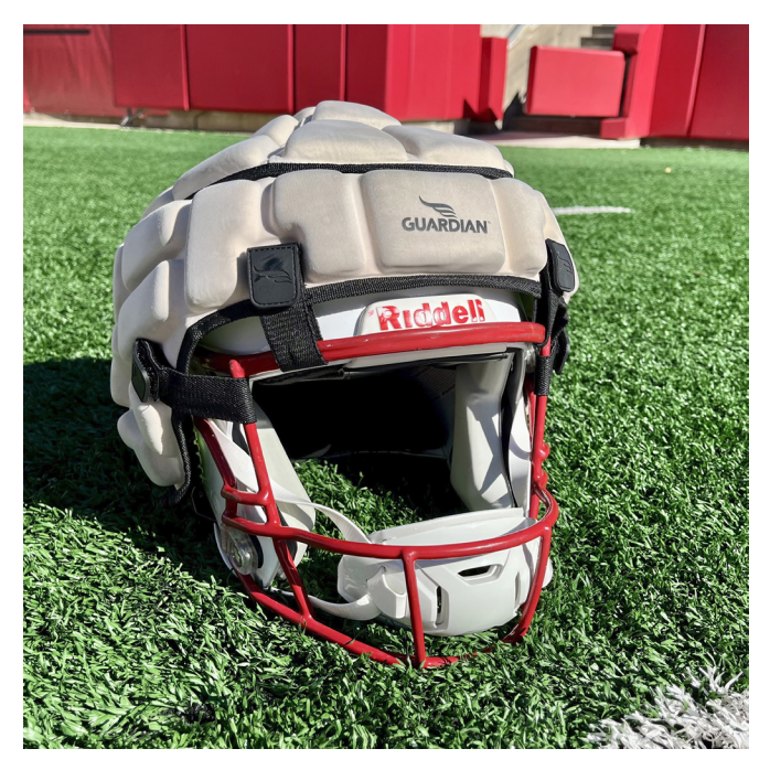
Figure 2 Football Guardian Caps NTX installed on a football helmet.

Aftermarket add-on shell devices for football helmets, such as the Guardian Cap (GC), have been developed to reduce head impact forces (figure 2). The use of these devices was mandated during the preseason in certain position groups by the NFL in 2022 on the premise of reducing the cumulative impact forces to the head.<sup>13</sup> Subsequently, the NFL attributed a significant reduction in concussion rates during the preseason to GCs.<sup>14</sup> Laboratory studies investigating the efficacy of GCs to reduce impact forces have had mixed results, and no studies have investigated the real-world effectiveness of GCs to prevent SRC in high school football players.<sup>15–17</sup> The objective of this study was to determine if GC use during practice was associated with a lower risk of SRC during practices or games among high school football players.