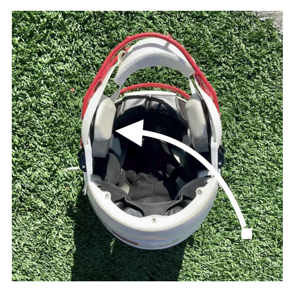
Figure 1 Football helmet with increased padding around the zygoma/mandible indicated by arrow.

To that end, progress has been made in reducing the risk of SRCs in high school football. When policies aimed at limiting contact in football practices were implemented, practice-related SRC rates were reduced by 64%.<sup>10</sup> Coach participation in a comprehensive football safety standards training programme also reduced the rate of SRCs in practices and games by 50%.<sup>11</sup> Modifications of helmets to increase padding over the zygoma/mandible were associated with a 31% lower rate of SRC (figure 1).<sup>12</sup> Interest in further improving the effectiveness of football helmets has continued.